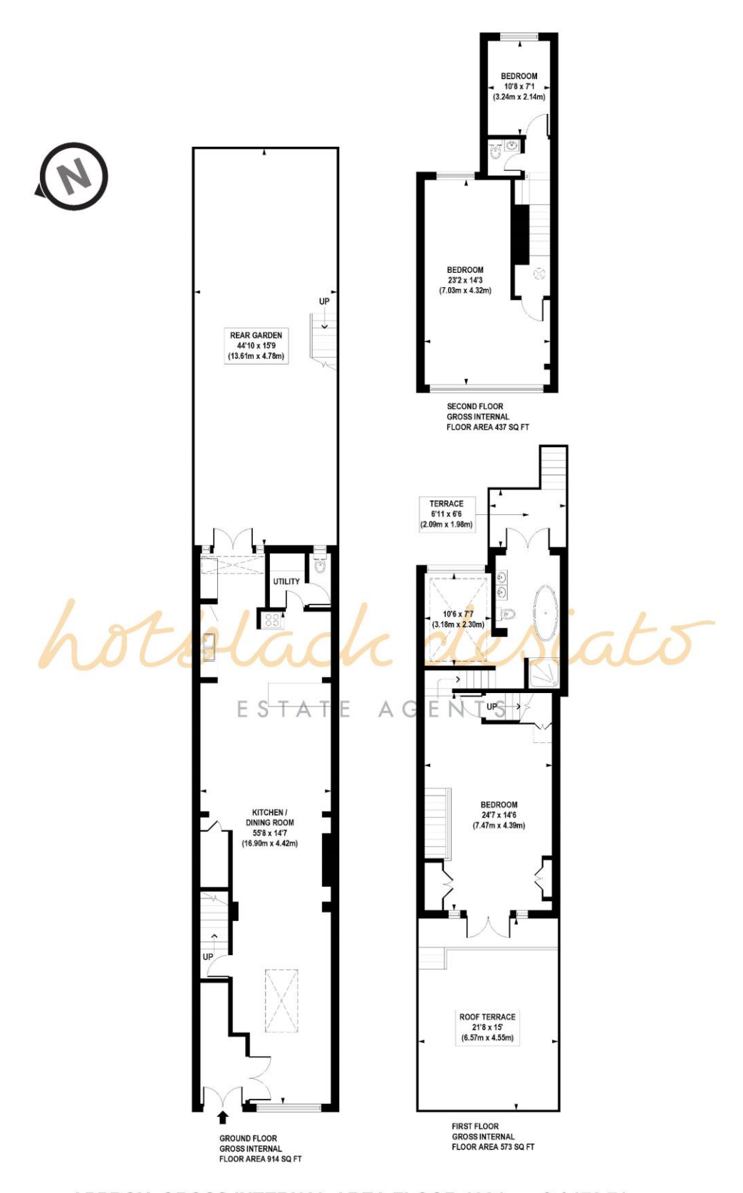
APPROX. GROSS INTERNAL AREA FLOOR 1924 sq. ft / 178.71 sq. m

Floorplan is for illustrative purposes only and is not to scale. Every attempt has been made to ensure the accuracy of the floorplan shown, however all measurements, fixtures, fittings and data shown are an approximate interpretation for illustrative purposes only. Liability for errors, omissions or mis-statement through negligence or otherwise is hereby excluded.