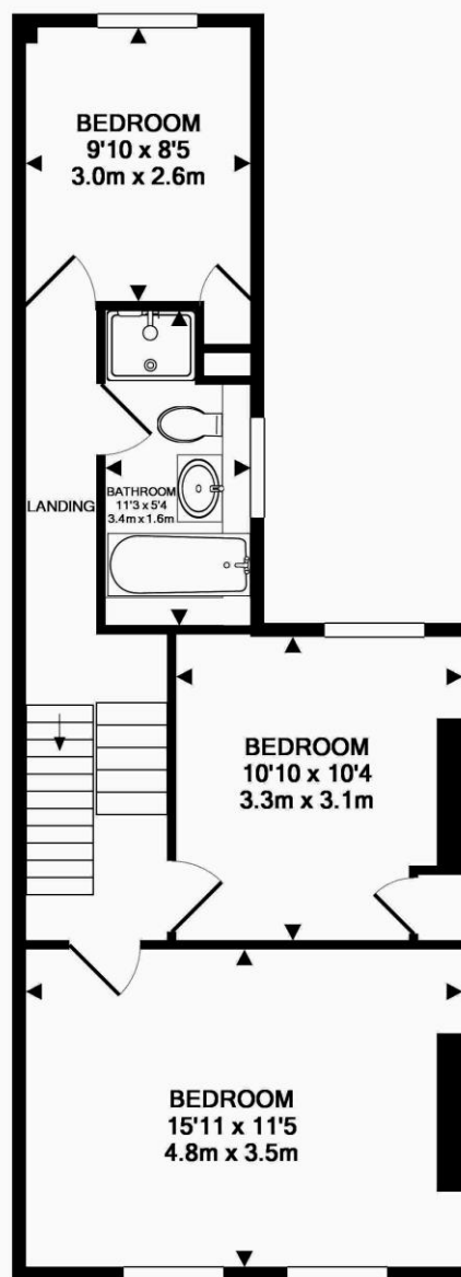
1ST FLOOR APPROX. FLOOR AREA 530 SQ.FT. (49.3 SQ.M.)

WYATT ROAD N5 TOTAL APPROX. FLOOR AREA 1087 SQ.FT. (100.9 SQ.M.) Measurements are approximate. Not to scale. Illustrative purposes only