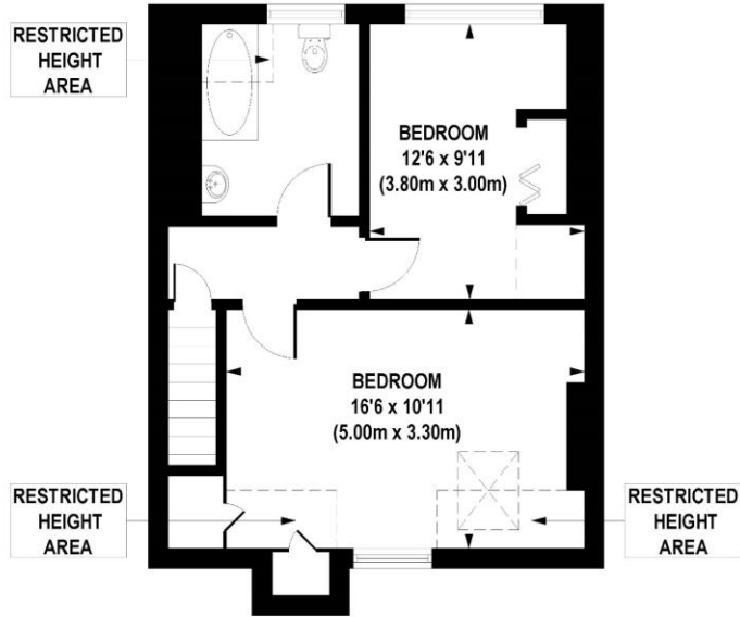
THIRD FLOOR GROSS INTERNAL FLOOR AREA 460 SQ FT